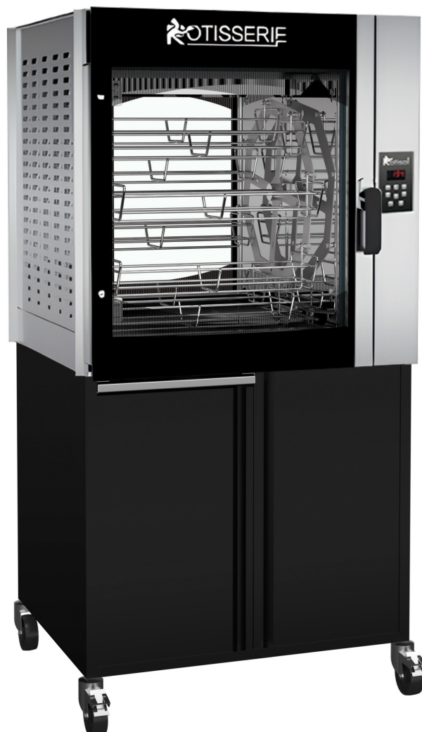
FBPT8.560 + FBP8.56MSTO (optional base cabinet)

Multiple recipes + manual control (+ can add up to 99 programs)