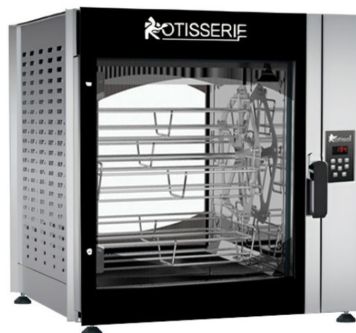
FBPT8.560 + FBP.PIED