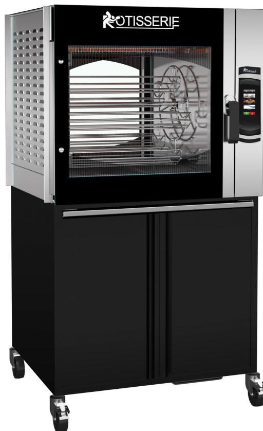
SCT5.560 + SC5.560MSTO (optional base cabinet)

Multiple Preset and manual recipes (+ can add up to 99 programs)