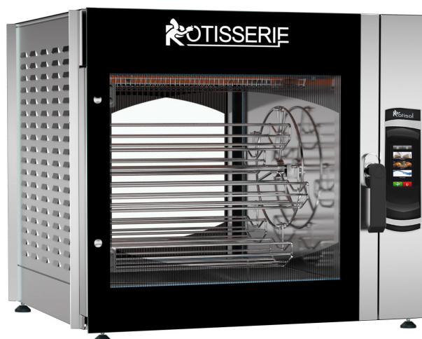
SCT5.560 + SC.PIED