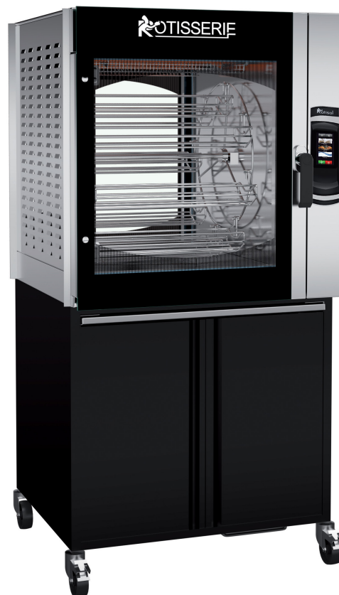
SCT8.560 + SC8.560MSTO (optional base cabinet)