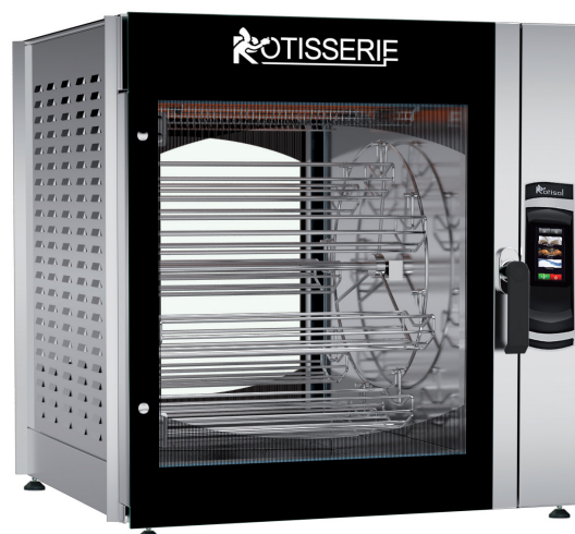
SCT8.560 + SC.PIED