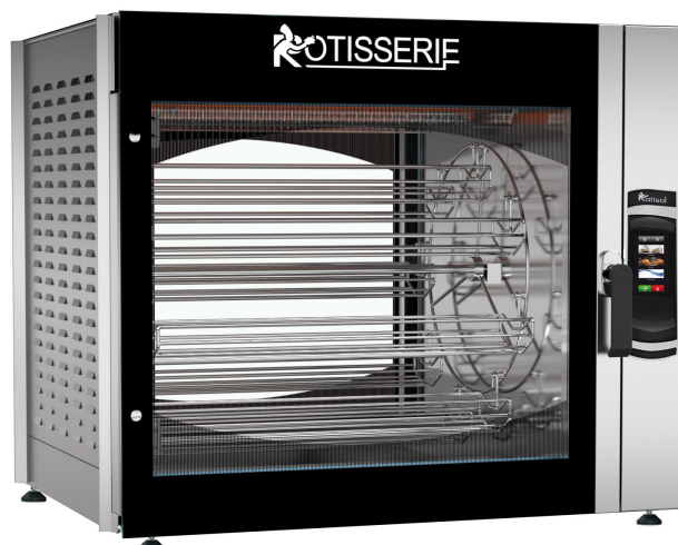
SCT8.760 + SC.PIED