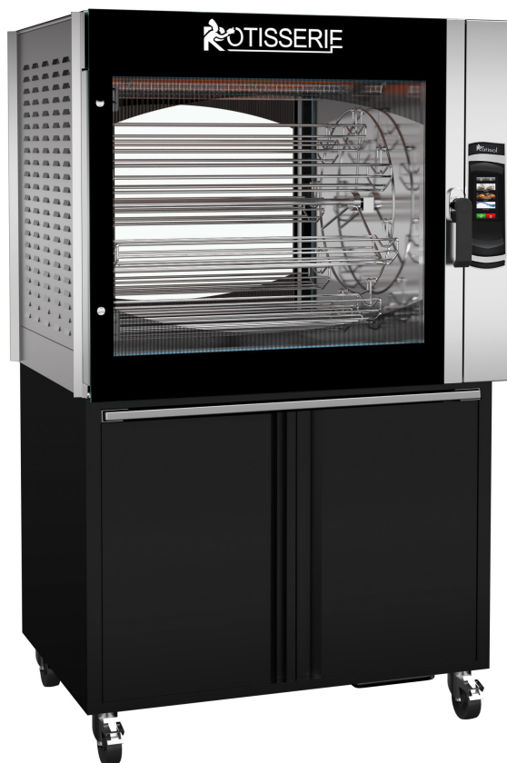
SCT8.760 + SC8.760MSTO (optional base cabinet)

Multiple Preset and manual recipes (+ can add up to 99 programs)